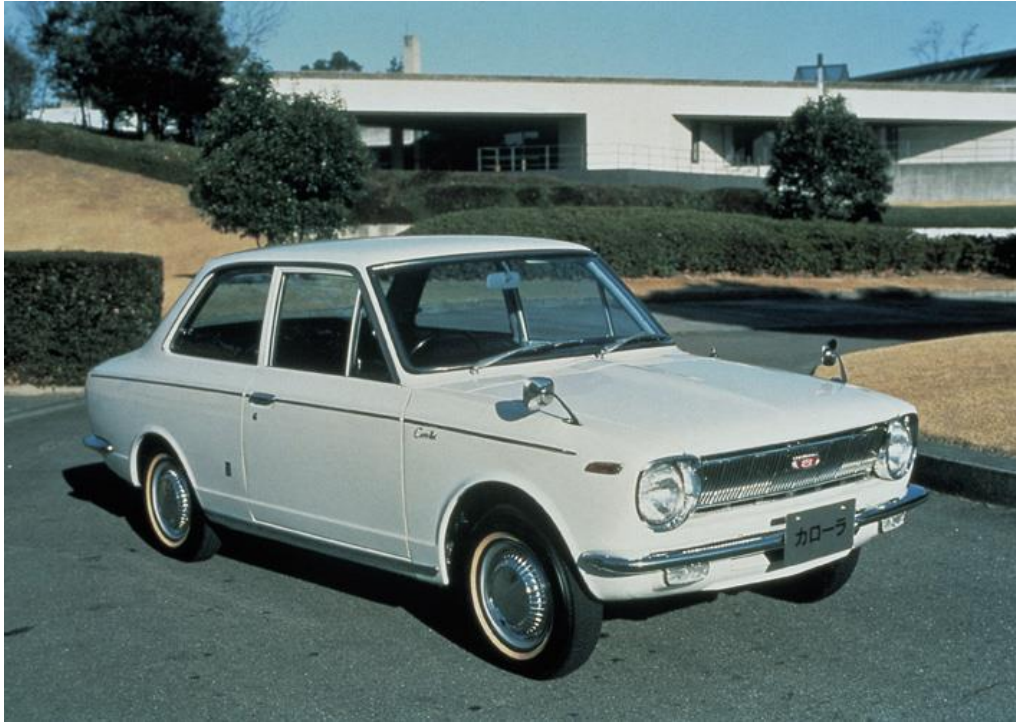
The Toyota Corolla was first sold in the UK in 1966.

Toyota's interests have not been confined to the automotive sector. Beyond its original textile weaving business, the company has expanded into prefabricated housing, telecommunications, forestry and boat-building.