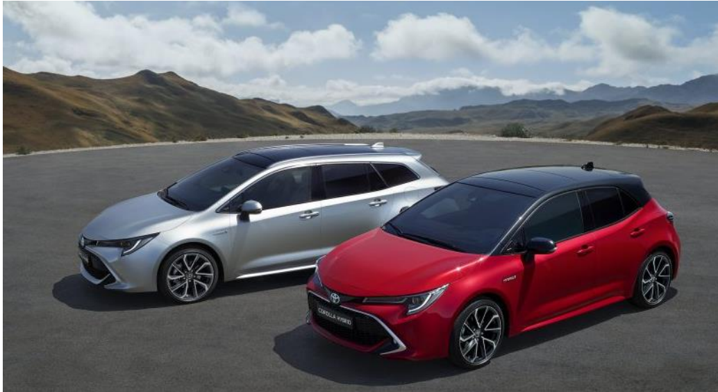
TMUK's Burnaston plant in Derbyshire is home to European production of the Corolla Hatchback and Touring Sports.

Vehicle imports are received at a facility at Portbury, near Bristol, and sales are handled by a national network of around 180 Toyota and 50 Lexus retailers.