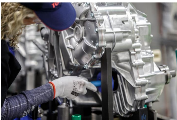
Transaxles fitted to the Corolla and C-HR hybrids

In 2009 Toyota announced a hybrid electric version of its Auris hatchback would be built at TMUK's Burnaston factory, its first hybrid model to be made in Europe. In 2012 the strategy took another step forward with the introduction of Yaris Hybrid, the first full hybrid electric supermini, built at the Valenciennes factory in France. The Toyota C-HR crossover followed in 2016, manufactured in Turkey. Meanwhile TMUK's Deeside engine plant produces hybrid petrol engines for both Corolla and C-HR, with hybrid transaxles manufactured for the same models at Toyota Motor Manufacturing Poland's Wałbrzych facility.