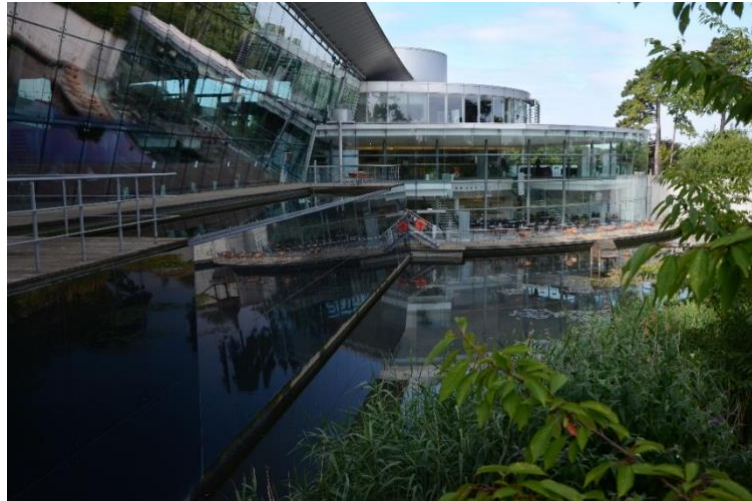
Toyota (GB) PLC headquarters near Epsom, Surrey

Toyota (GB) PLC is the company responsible for sales, marketing, after sales and customer relations for Toyota and Lexus in the UK. The sales performance in past years has consolidated the UK's position as one of Toyota's strongest European markets. It has regularly been listed in the Sunday Times 100 Best Companies to Work For survey, rising to 15 th in the rankings in 2020.