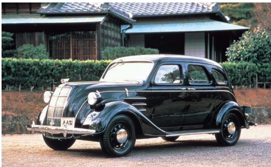
Sakichi Toyoda prepared his car manufacturing business by visiting the USA and observing Ford's production lines. Back home he adapted that system to suit the smaller number of cars to be built in his own factory.

The Toyota success story is built on innovation, both in terms of its products and the processes by which they are made. In 1918, Sakichi Toyoda revolutionised the weaving industry with his invention of an automatic loom. The proceeds from the sale of his patent to a British firm – Platt Brothers of Oldham – provided his son Kiichiro with the finances to make a start in the developing car industry. The pioneering work practices that Sakichi had developed for his loom business were easily adapted to the new automotive operation and in 1936 the first prototype car, the Toyoda AA, was completed.