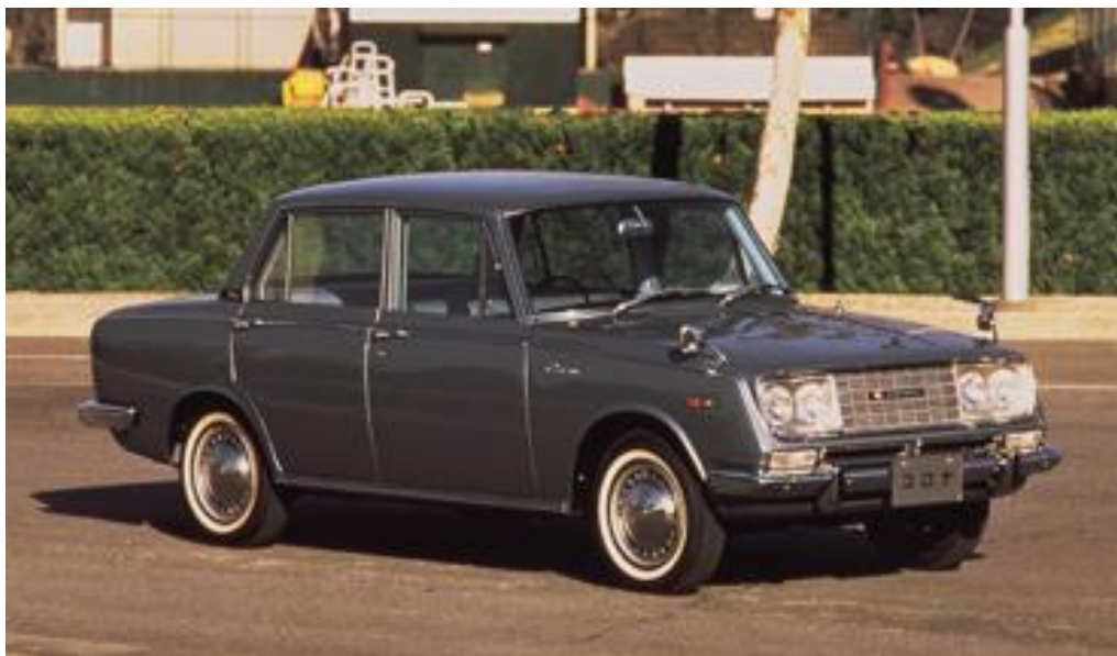
In 1965, the price tag on the Corona, Toyota's first UK model, was £777. That's the equivalent of about £12,000 in today's money.

In the early 1960s Toyota began exporting cars to Europe, first to Denmark. In 1965 it entered the UK market, launching the Corona saloon at the Earls Court Motor Show. The following year the original Corolla was launched, the debut of what was destined to become the world's most successful model range with global sales of more than 46 million (as of 2019).